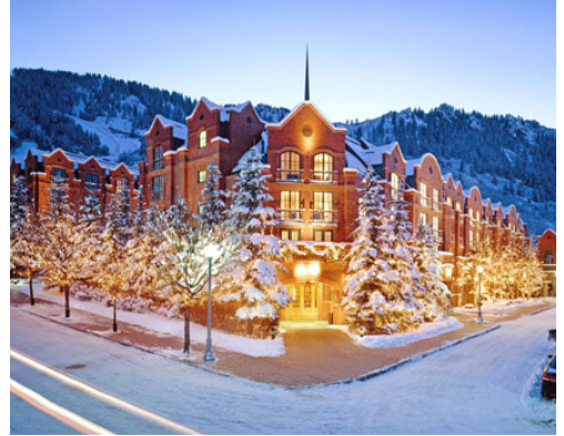
St. Regis Aspen Resort - Aspen, Colorado

R+B is currently serving as the Architect of Record (AOR) on the renovation of the St. Regis Aspen Resort. The St. Regis Aspen Resort is known to be one of the world's best and most desirable places to stay. It is ideally located at the base of Aspen Mountain and set among the heart of Aspen. The scope of the renovation includes 179 guest rooms and suites, the restaurant, lobby and all other public spaces. R+B services include construction documentation as well as being the "eyes and ears" of the renovation.