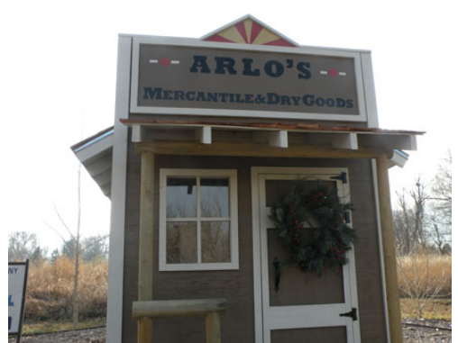
Arlo's Mercantile makes its' debut at the Trail of Lights at Chatfield Reservoir in Littleton, Colorado

aspen office: 117 s. monarch st aspen co 81611 t 970.544.9006 | f 970.544.3473