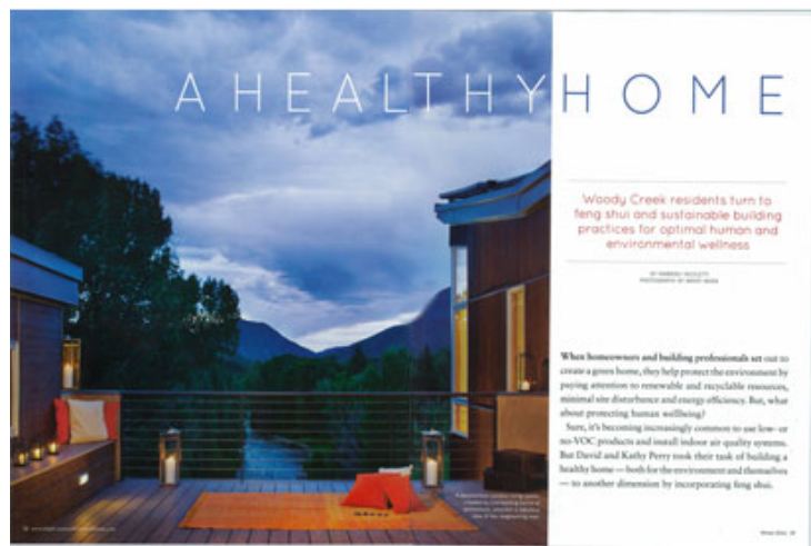
High Country House and Home - "A Healthy Home" Woody Creek Modern