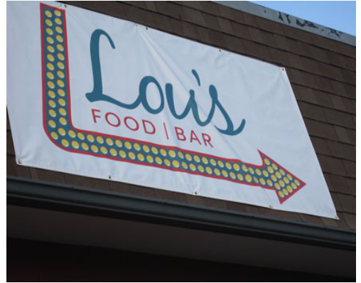
Lou's Food Bar - Denver, Colorado

Located right in the heart of North Denver's Sunnyside neighborhood is Lou's Food Bar. Formerly, Ron and Dan's Keg Lounge, Lou's Food Bar is a complete transformation from a time-honored Denver dive bar into a charming American bistro with French influences. A completely new kitchen addition was designed on the north side of the rectangular-shaped building while the south side features a new double entry with a traditional vestibule. Inside, the dining room features a combination of booths, circular banquettes and two and four top tables. The original bar has been retained and spans the length of the restaurant and seats up to 25 people. Parallel to the bar sits a charcuterie which sets the mood for the quaint, unique gastro pub. Lou's Food Bar is now open for business and is located at 1851 W. 38th Avenue. Visit www.lousfoodbar.com for more information.