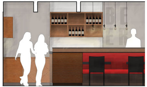
A rendered depiction of the new bb's kitchen in Aspen, Colorado.

bb's kitchen is now open! The new Aspen restaurant features a full bar, outdoor seating on the patio and a welcoming fireplace in the lounge. Serving up high quality, home-cooking in a sophisticated yet casual setting, the design matches the food with an eclectic and modern aesthetic. Once the home of the David Floria and 212 galleries in the Aspen Grove building, bb's kitchen features a main dining area comprised of comfortable yet elegant booth and banquette seating in warm deep red tones. Adjacent to the dining room is a full bar that mirrors the casual/elegant atmosphere of the dining room. The outdoor patio takes full advantage of Aspen Mountain views. Additional interior details include rich wood paneling around the bar accented by grey glass mirror backslashes. The mood of the bar and dining room is established with simple, single light pendants and large glass windows beyond ensuring that the feel is perfect for breakfast, lunch or dinner. The seating arrangement provides flexibility for large parties or smaller groups. Adjacent to the kitchen space is a lounge with a dedicated bar. Modern furnishings throughout the lounge area include plush chairs, leather ottomans and contemporary cocktail tables. bb's kitchen is located at 525 E. Cooper Avenue on the second level. Be sure to check out the new restaurant.